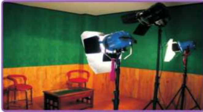
Equipment added during the year