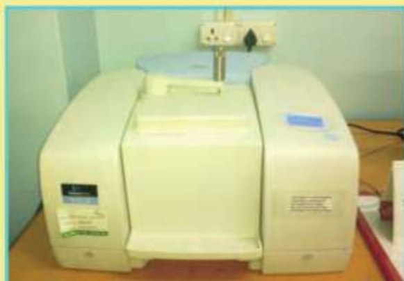
FTIR Spectrophotometer: Commissioned on 20/6/2012 for Spectroscopic Characterization