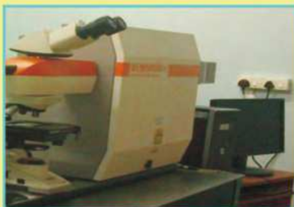
Raman Spectrometer: Commissioned on 21/7/2012 for Spectroscopic Characterization