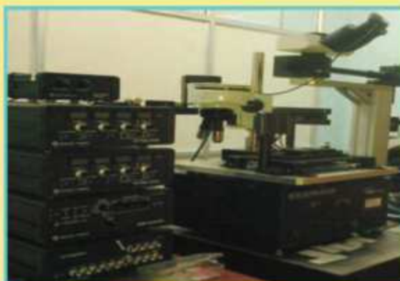
AFM: Commissioned on 12/10/2012 for Surface analysis