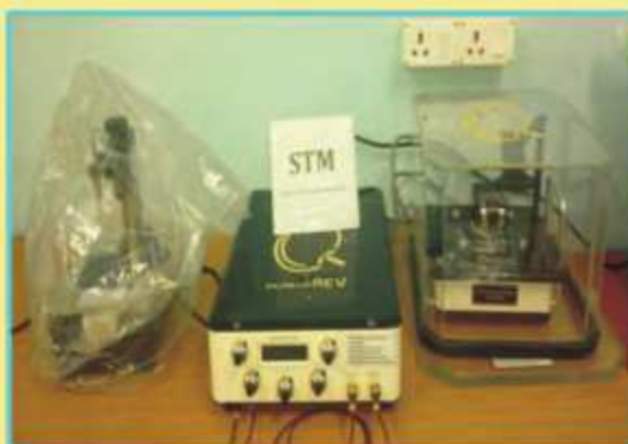
Air-STM : Commissioned in 31/05/2012 for surface analysis