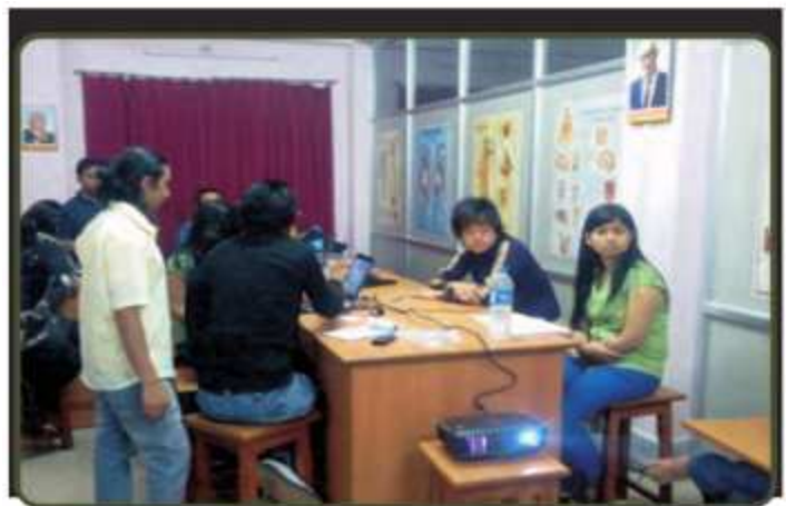
Students conducting practical on Cantab and Nexus 10 vision.