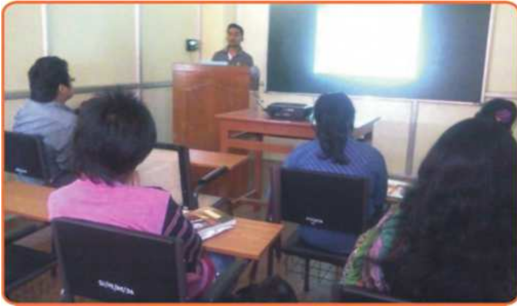
Students participating in paper presentation

The department has established a well-equipped laboratory in this region to undertake researches in frontiers of psychology. Students regularly conduct practicum on students from various departments of Sikkim University by using both modern and traditional instruments/tests. All the students and faculty members of the department conduct practicum by following the strict laboratory guidelines that have already been prepared and displayed in the laboratory. For the purpose of teaching, conducting practical and researches, the department has already procured various tests/instruments such as intelligence tests, personality tests, tests on learning, emotion, perception, memory, etc. Some of the modern psychological instruments that have already been procured in the laboratory recently are: