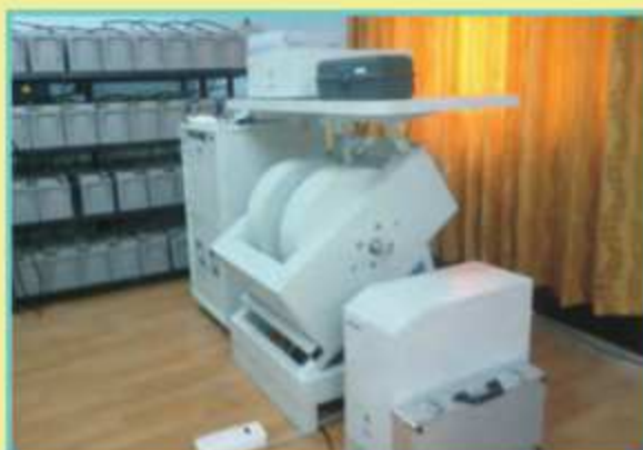
CW EPR, X-band: Commissioned on 04/03/ 2013 for Spin Measurements