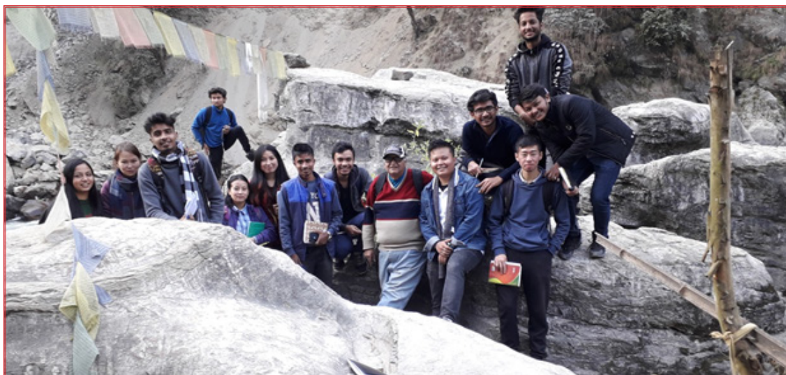
Undergraduate students of the Geology Department are observing the fossils of Early Life in Buxa Dolomite ( 1000 Million years old ) during field work in Rangeet River section , South Sikkim in December, 2019