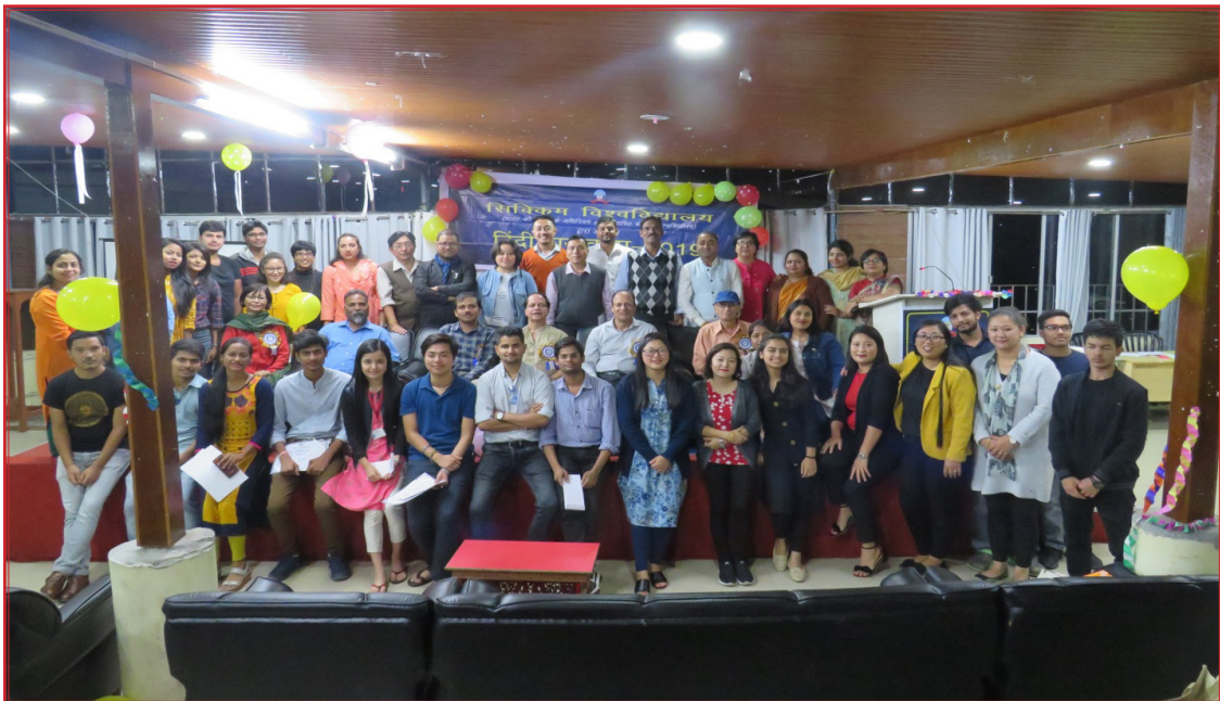
Group Photograph of winners of various competitions with distinguished guests of the closing ceremony of Hindi Pakhawada-2019