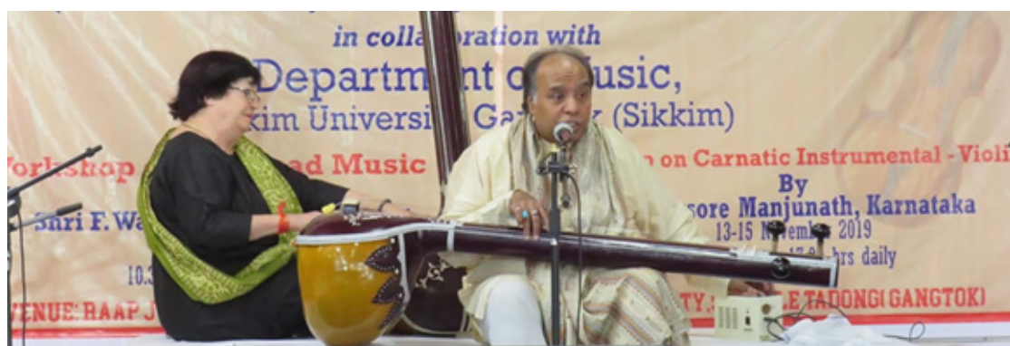
4-day workshop on Dhrupad and Carnatic Violin | 13-16 November 2019