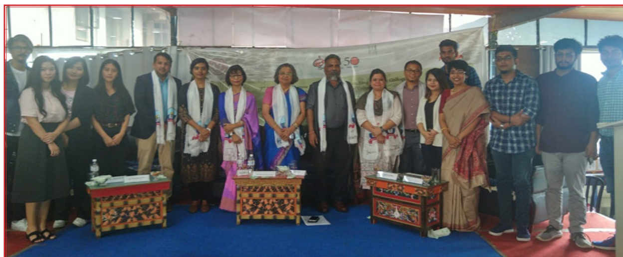
2nd ICS-Harvard Yenching Colloquium organized by the Department of Chinese, Sikkim University, 11 June 2019