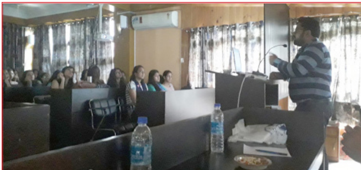
Special Lecture on Suicide Prevention among Youth