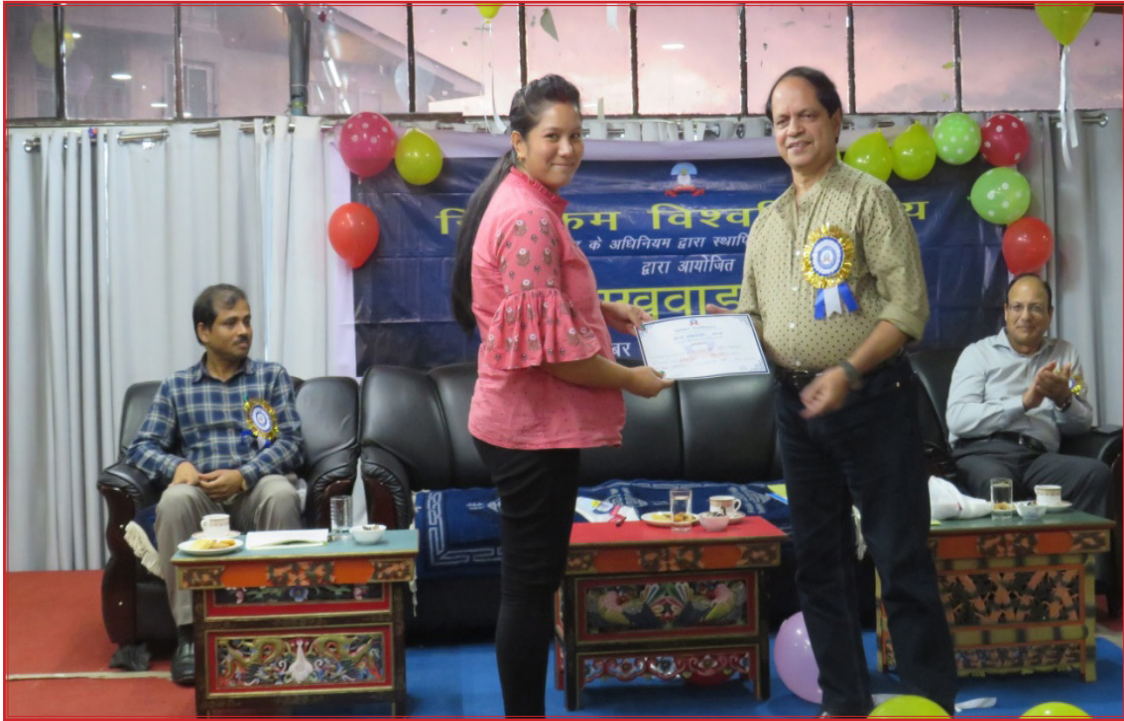
Cash Prize and Certificate distribution