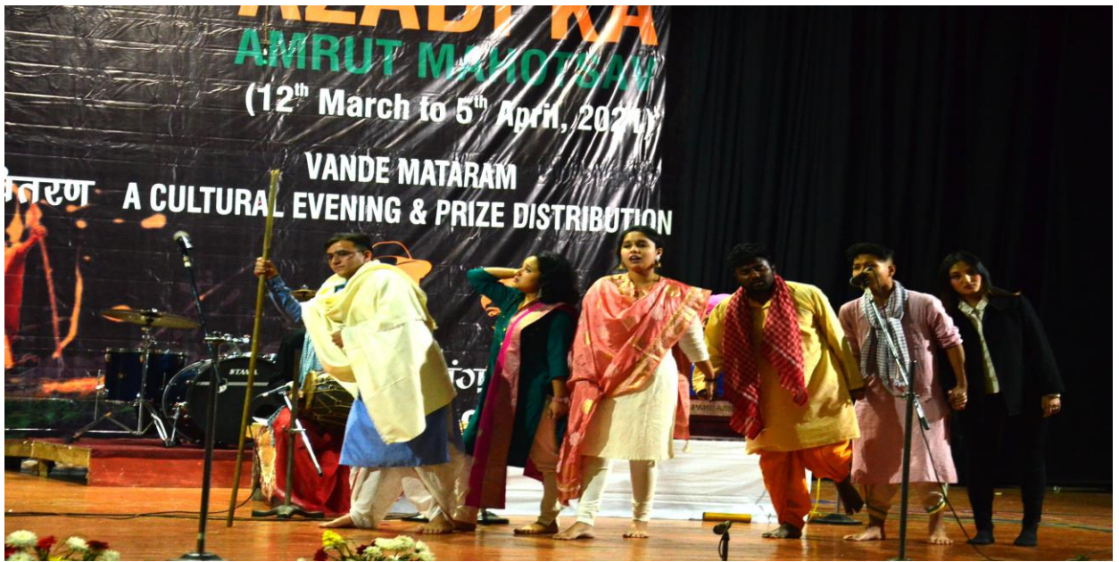
Students of Music Department, Sikkim University displaying the historical Dandi March on the occasion of celebration of 75 years of India's Independence under the theme "AZADI KI AMRUT MAHOTSAV" at Mannan Kendra, Gangtok on 5 th April 2021.