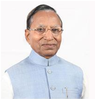
THE CHIEF RECTOR Shri Ganga Prasad Hon'ble Governor of Sikkim